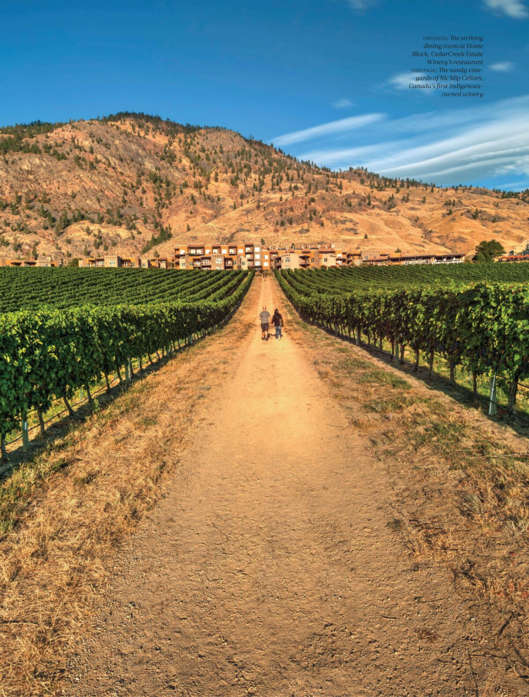
OPPOSITE: The striking dining room at Home Block, CedarCreek Estate Winery's restaurant THIS PAGE: The sandy vineyards of NK Mip Cellars, Canada's first Indigenous-owned winery